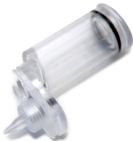
Proprietary Xisyl Cartridge

Automated Nucleic Acid Sample Preparation