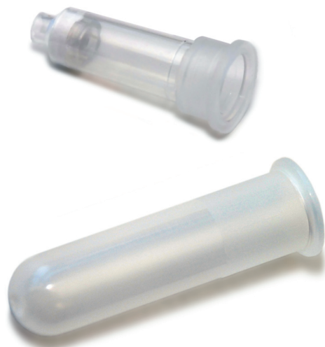
ArcPure Spin Column